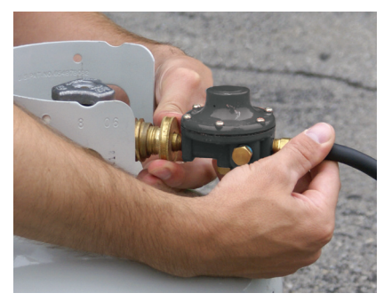
FIGURE 4: PROPANE HOSE THREADED INLET