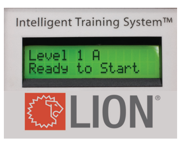
FIGURE 22: READY TO LIGHT THE SYSTEM