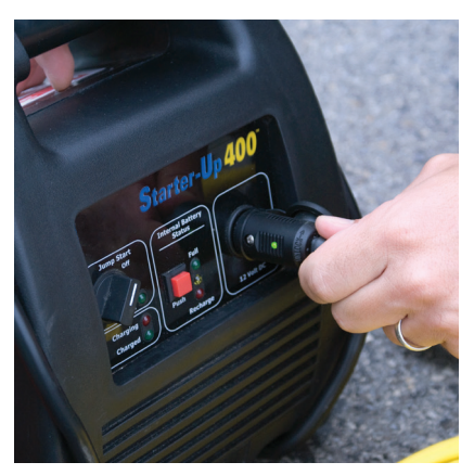
FIGURE 7: 12VDC BATTERY PACK