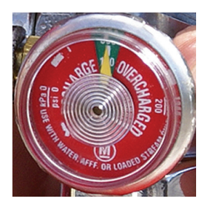
FIGURE 17: CORRECTLY CHARGED