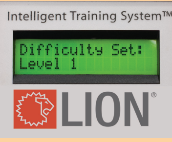
FIGURE 24: SETTING THE DIFFICULTY