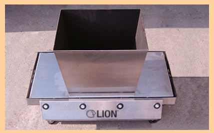
FIGURE 14: CORRECTLY MOUNTED TRASH CAN PROP