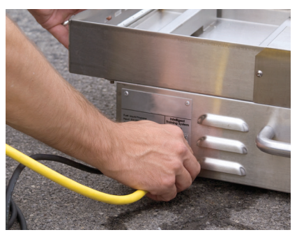
FIGURE 3: POWER CABLE