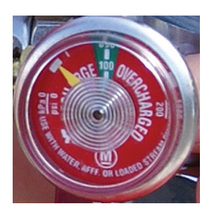
FIGURE 15: UNCHARGED