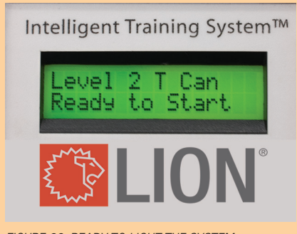
FIGURE 26: READY TO LIGHT THE SYSTEM