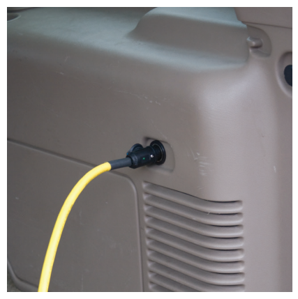
FIGURE 6: 12VDC CAR OUTLET

The pressure regulator and hose assembly supplied with the appliance MUST be used and replacement pressure regulators and hose assemblies must be those specified by the appliance manufacturer. <u>DO NOT alter any part of the hose assembly!</u>