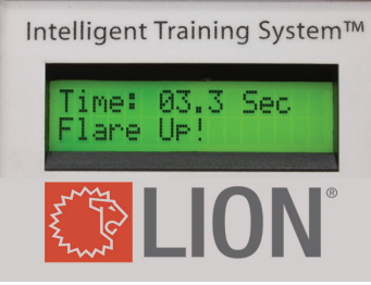
FIGURE 23: FLARE UP!

extinguished. The screen will display Flare Up! as well.