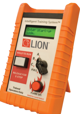
FIGURE 18: I.T.S. CONTROLLER