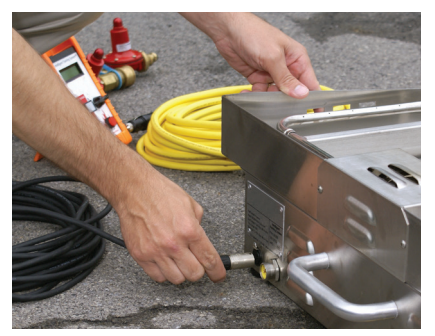
FIGURE 2: CONTROLLER CABLE