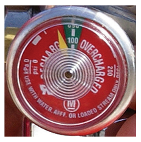
FIGURE 16: UNDER CHARGED