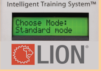
FIGURE 19: STANDARD MODE AND PROP MODE