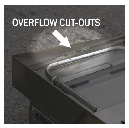
FIGURE 9: OVERFLOW CUT-OUTS