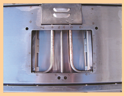
FIGURE 11: CLOSE UP OF MOUNT POSITIONS