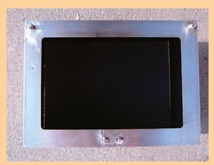
FIGURE 12: BOTTOM OF TRASH CAN WITH MOUNTING PEGS