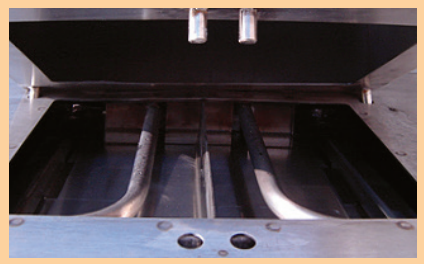
FIGURE 13: REAR PEGS IN PLACE