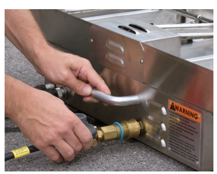
FIGURE 5: PROPANE HOSE QUICK DISCONNECT OUTLET