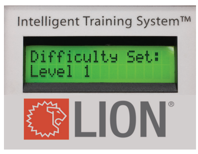
FIGURE 21: SETTING THE DIFFICULTY